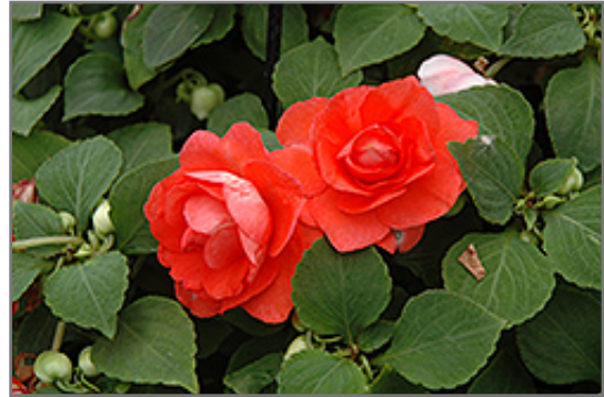
Fiesta Ole Salmon Double Impatiens flowers