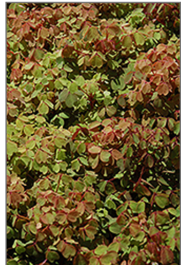
Sunset Velvet Shamrock foliage