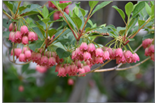
Redvein Enkianthus flowers