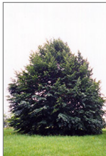
European Beech