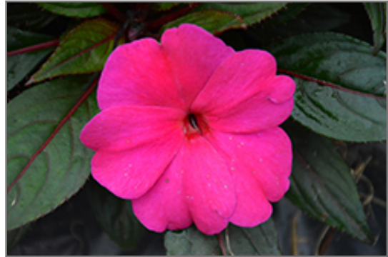
Magnum Blue New Guinea Impatiens flowers

Magnum Blue New Guinea Impatiens is recommended for the following landscape applications;