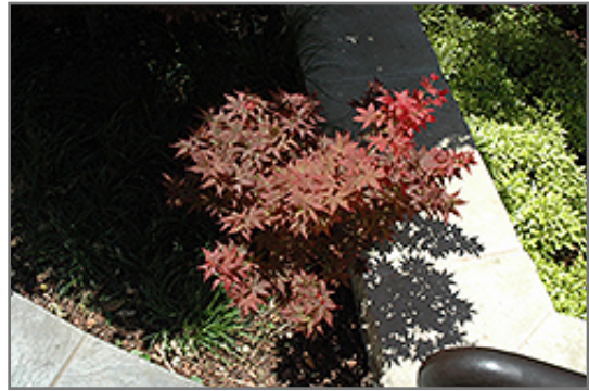
Ruby Stars Japanese Maple