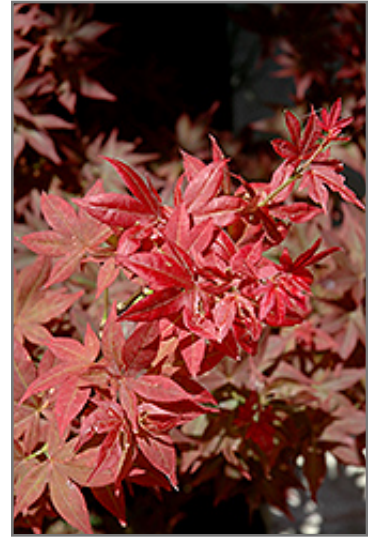
Ruby Stars Japanese Maple foliage

Ruby Stars Japanese Maple is recommended for the following landscape applications;