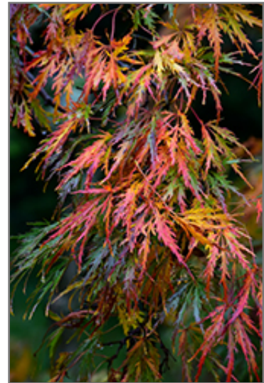
Cutleaf Japanese Maple in fall

Cutleaf Japanese Maple makes a fine choice for the outdoor landscape, but it is also well-suited for use in outdoor pots and containers. Because of its height, it is often used as a 'thriller' in the 'spiller-thriller-filler' container combination; plant it near the center of the pot, surrounded by smaller plants and those that spill over the edges. It is even sizeable enough that it can be grown alone in a suitable container. Note that when grown in a container, it may not perform exactly as indicated on the tag - this is to be expected. Also note that when growing plants in outdoor containers and baskets, they may require more frequent waterings than they would in the yard or garden.