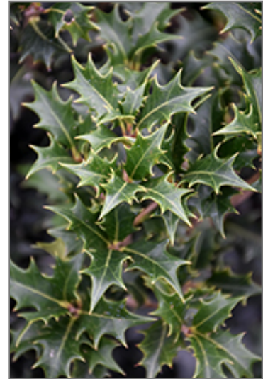
Gulftide Osmanthus foliage

Gulftide Osmanthus is recommended for the following landscape applications;