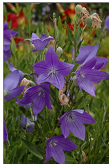
Fuji Blue Balloon Flower flowers