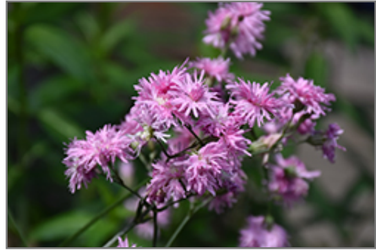
Petite Jenny Ragged Robin Campion flowers

Petite Jenny Ragged Robin Campion is recommended for the following landscape applications;