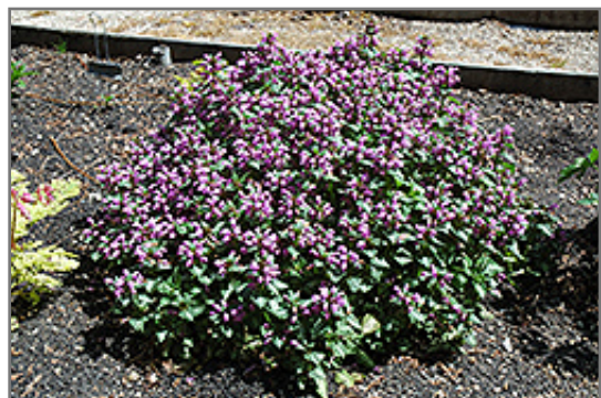
Beacon Silver Spotted Dead Nettle in bloom