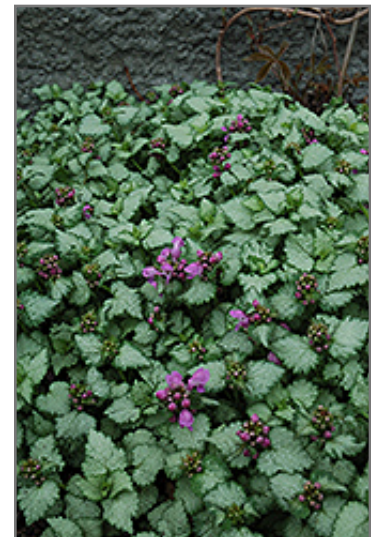
Red Nancy Spotted Dead Nettle in bloom