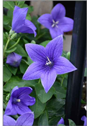
Pop Star Blue Balloon Flower flowers

Pop Star Blue Balloon Flower is recommended for the following landscape applications;