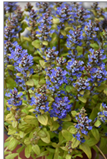
Feathered Friends Fancy Finch Bugleweed flowers