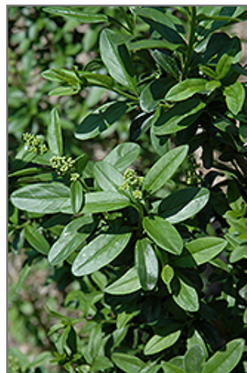
California Privet foliage