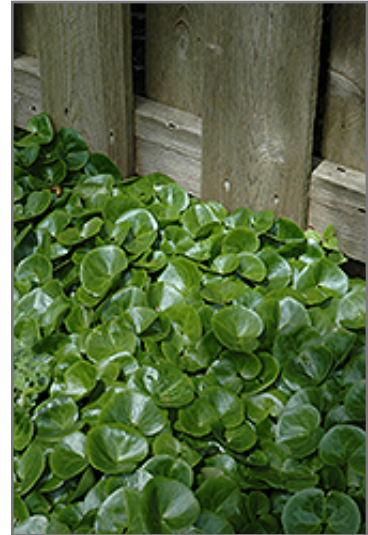
European Wild Ginger