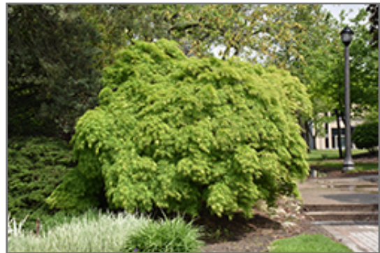
Viridis Japanese Maple