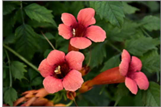
Flamenco Trumpetvine flowers