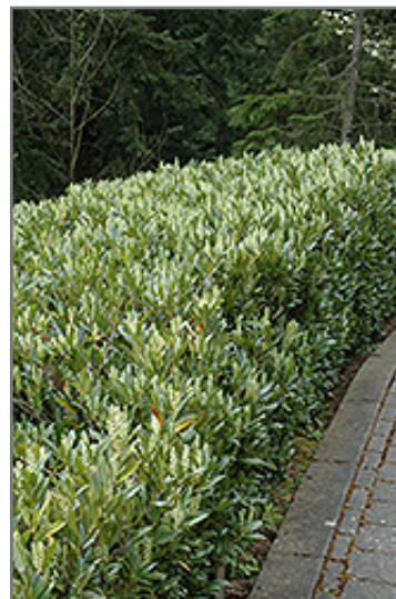
Otto Luyken Cherry Laurel in bloom