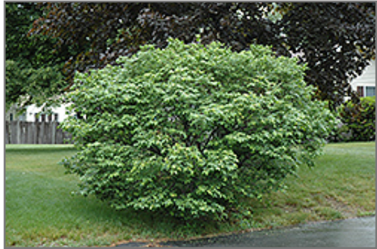
Dwarf-Winged Burning Bush

Dwarf-Winged Burning Bush will grow to be about 7 feet tall at maturity, with a spread of 7 feet. It tends to fill out right to the ground and therefore doesn't necessarily require facer plants in front, and is suitable for planting under power lines. It grows at a slow rate, and under ideal conditions can be expected to live for 50 years or more.