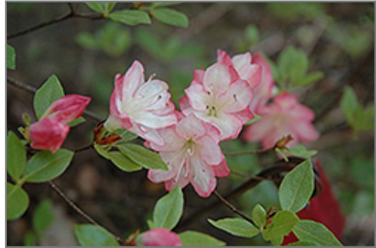
Apple Blossom Azalea flowers

This stunning, compact evergreen shrub is bathed in clusters of beautiful white blooms with pink edges every spring and has loads of interest for the rest of the year; an excellent choice to mass in groupings as a focal point of the garden