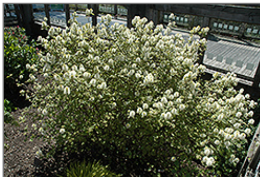
Mt. Airy Fothergilla in bloom