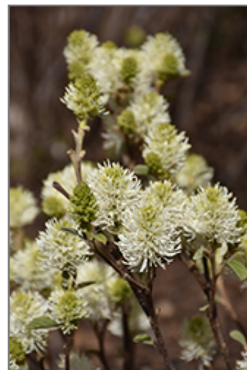
Mt. Airy Fothergilla flowers

Mt. Airy Fothergilla is recommended for the following landscape applications;