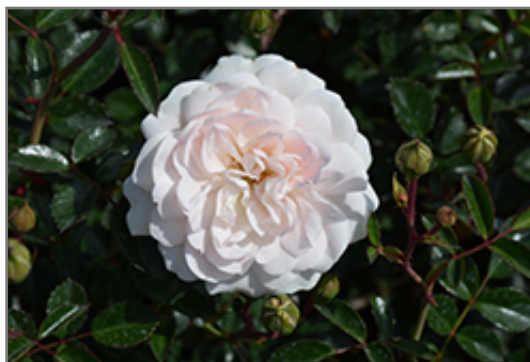
Sea Foam Rose flowers