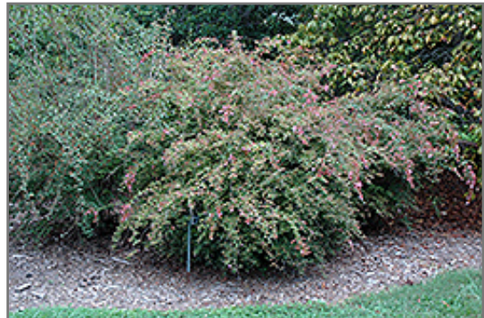
Edward Goucher Abelia in bloom