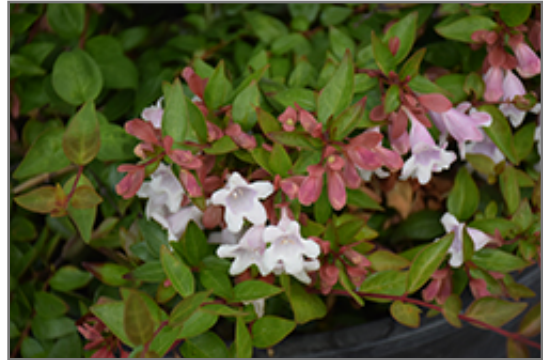
Edward Goucher Abelia flowers

Edward Goucher Abelia is recommended for the following landscape applications;