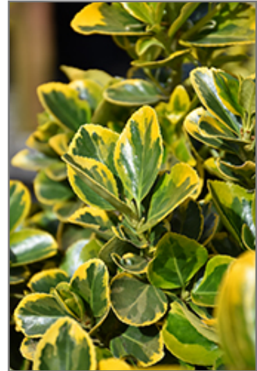
Gold Variegated Japanese Euonymus foliage