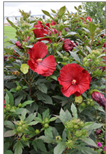
Summerific Cranberry Crush Hibiscus flowers