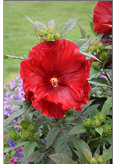
Summerific Cranberry Crush Hibiscus flowers