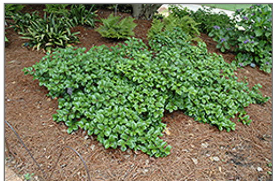
Maryland Dwarf American Holly