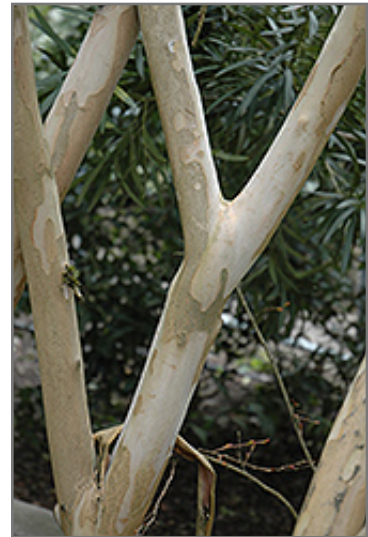
Zuni Crapemyrtle bark

Zuni Crapemyrtle makes a fine choice for the outdoor landscape, but it is also well-suited for use in outdoor pots and containers. Because of its height, it is often used as a 'thriller' in the 'spiller-thriller-filler' container combination; plant it near the center of the pot, surrounded by smaller plants and those that spill over the edges. It is even sizeable enough that it can be grown alone in a suitable container. Note that when grown in a container, it may not perform exactly as indicated on the tag - this is to be expected. Also note that when growing plants in outdoor containers and baskets, they may require more frequent waterings than they would in the yard or garden.