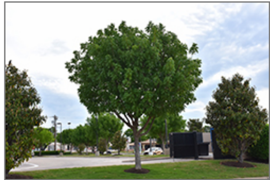
Chinese Pistache