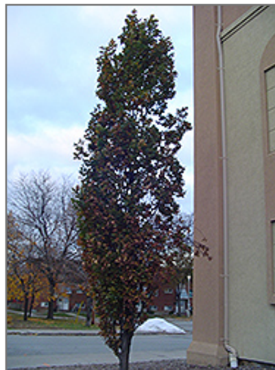
Columnar English Oak in fall