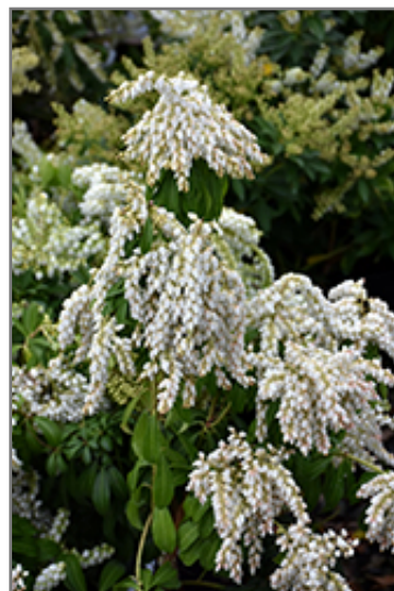
Sarabande Japanese Pieris flowers

Sarabande Japanese Pieris will grow to be about 3 feet tall at maturity, with a spread of 4 feet. It tends to be a little leggy, with a typical clearance of 1 foot from the ground. It grows at a slow rate, and under ideal conditions can be expected to live for 40 years or more.