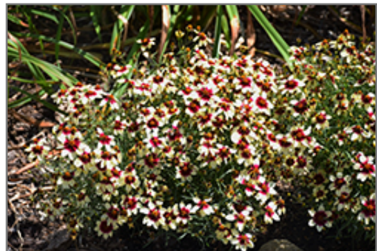
Sizzle And Spice Red Hot Vanilla Tickseed in bloom