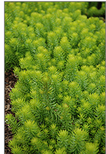
Angelina Sedum foliage