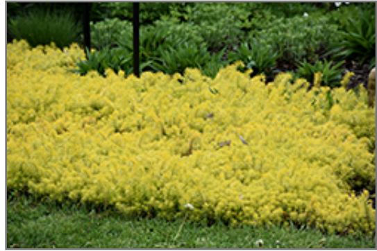
Angelina Sedum

Angelina Sedum will grow to be about 8 inches tall at maturity, with a spread of 12 inches. When grown in masses or used as a bedding plant, individual plants should be spaced approximately 10 inches apart. Its foliage tends to remain low and dense right to the ground. It grows at a fast rate, and under ideal conditions can be expected to live for approximately 10 years. As an herbaceous perennial, this plant will usually die back to the crown each winter, and will regrow from the base each spring. Be careful not to disturb the crown in late winter when it may not be readily seen!