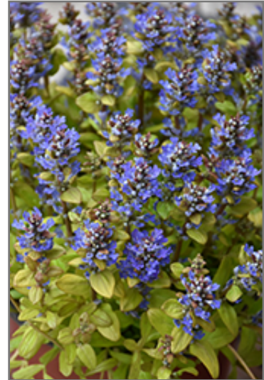
Feathered Friends Fancy Finch Bugleweed flowers