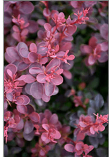
Royal Burgundy Japanese Barberry foliage