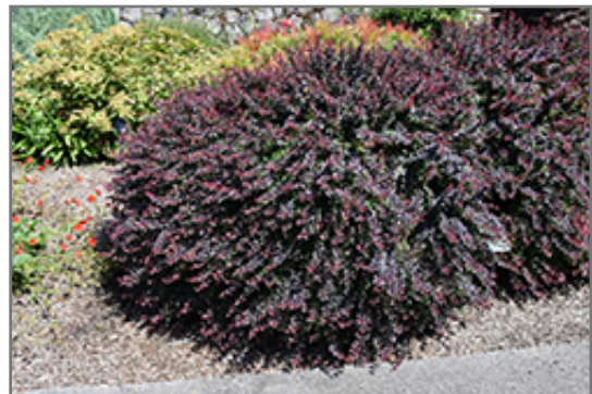
Royal Burgundy Japanese Barberry