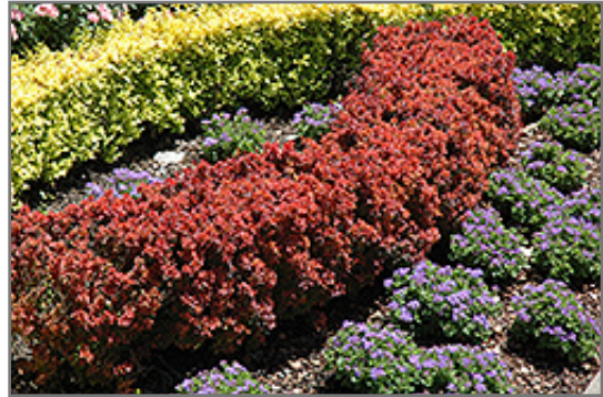
Royal Burgundy Japanese Barberry

Royal Burgundy Japanese Barberry will grow to be about 3 feet tall at maturity, with a spread of 3 feet. It tends to fill out right to the ground and therefore doesn't necessarily require facer plants in front. It grows at a medium rate, and under ideal conditions can be expected to live for approximately 20 years.