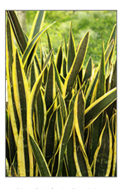
Black Gold Snake Plant foliage

When grown indoors, Black Gold Snake Plant can be expected to grow to be about 3 feet tall at maturity, with a spread of 12 inches. It grows at a slow rate, and under ideal conditions can be expected to live for approximately 10 years. This houseplant performs well in both bright or indirect sunlight and strong artificial light, and can therefore be situated in almost any well-lit room or location. It is very adaptable to both dry and moist soil, but will not tolerate any standing water. The surface of the soil shouldn't be allowed to dry out completely, and so you should expect to water this plant once and possibly even twice each week. Be aware that your particular watering schedule may vary depending on its location in the room, the pot size, plant size and other conditions; if in doubt, ask one of our experts in the store for advice. It will benefit from a regular feeding with a general-purpose fertilizer with every second or third watering. It is not particular as to soil pH, but grows best in sandy soil. Contact the store for specific recommendations on pre-mixed potting soil for this plant.