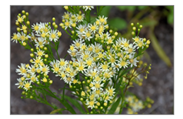
Sugar Kisses Goldenrod flowers