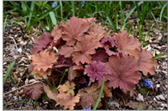
Mega Caramel Coral Bells

Mega Caramel Coral Bells is recommended for the following landscape applications;