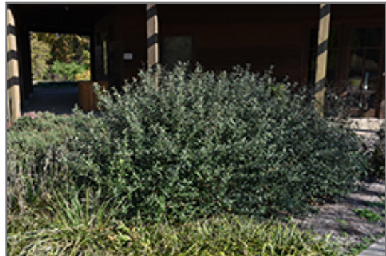
Prague Viburnum