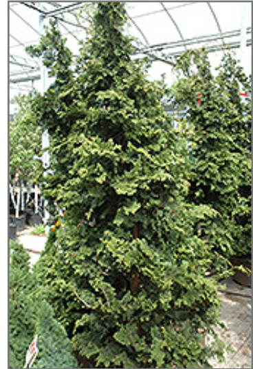
Wells Special Hinoki Cypress