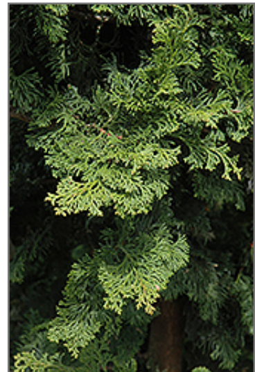
Wells Special Hinoki Cypress foliage