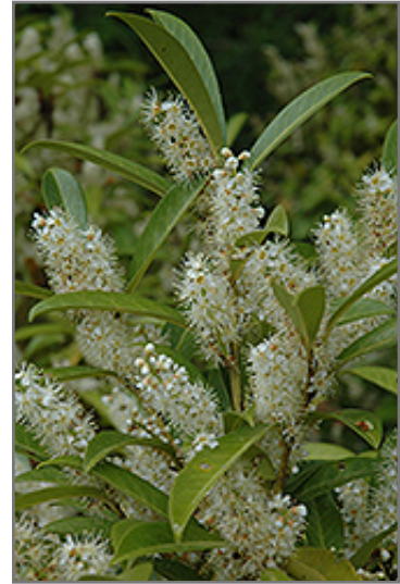
Skip Laurel flowers

Skip Laurel is recommended for the following landscape applications;