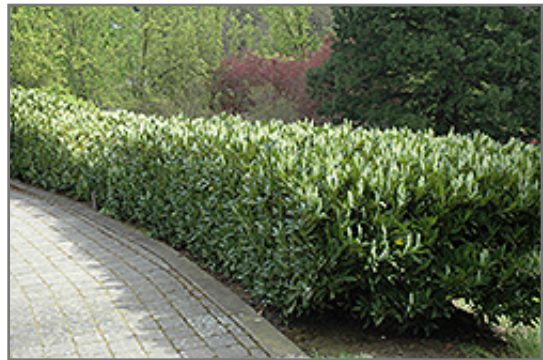
Skip Laurel in bloom